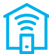
Smart Home, Smart Building

Oventrop is the partner for efficient heating, cooling and clean potable water. The modular systems and services offer pioneering solutions which all HVAC experts use to work with – easily and flexibly – from planning to installation, from industry to trade. As a family business, Oventrop accompanies all its partners over many years – competently and personally.